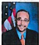
NY State Senator