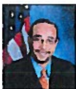
NY State Senator